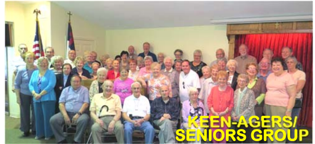
Meeting/Lunch/Entertainment Thursday, July 28th at 11:30